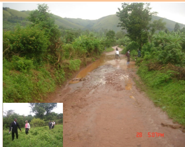
Some Infrastructural Hindrances' to Couple Visits